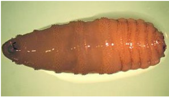
C. hominivorax larva